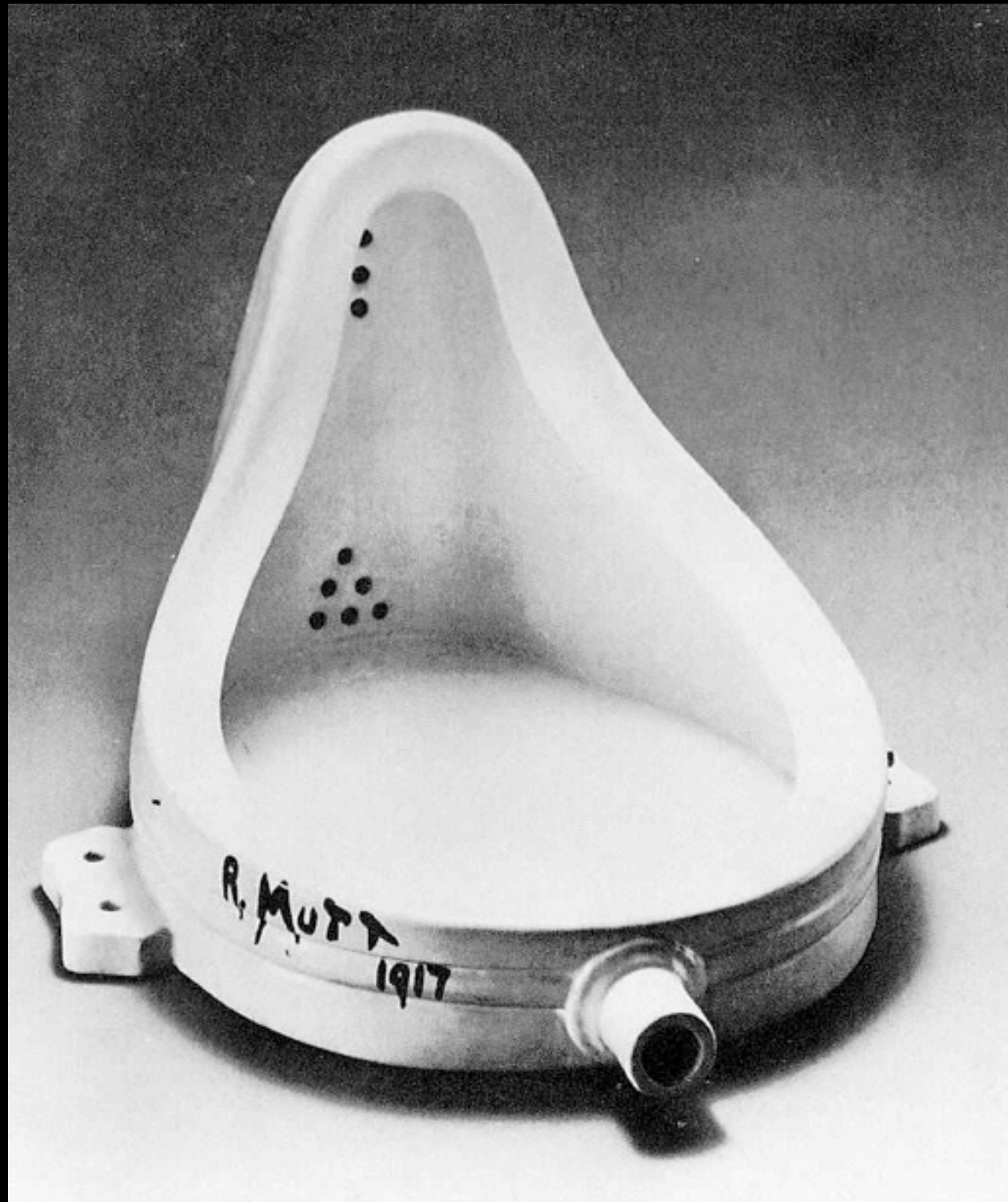
Marcel Duchamp, Fountain (Urinal), 1917